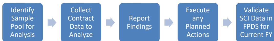
Figure 1: Analysis Process

To ensure the Department sufficiently addressed the service contract inventory requirements and developed a meaningful Analysis Report, a working group was utilized consisting of representatives from each of DOC's five contracting offices. As a result of the collaborative effort of the working group, a repeatable process, as depicted in Figure 1, was established to comply with the annual service contract inventory requirements.